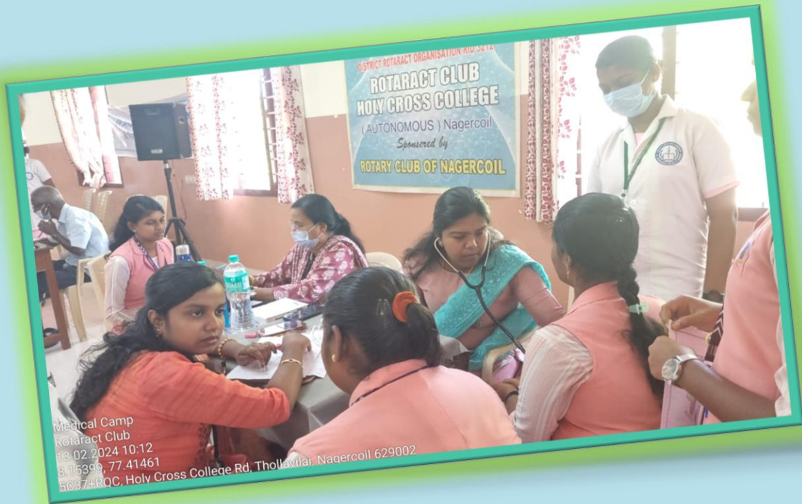
Medical Camp Rotaract Club 13.02.2024 10:12 8.15399, 77.41461 5C37+RQC, Holy Cross College Rd, Thollavilai, Nagercoil 629002