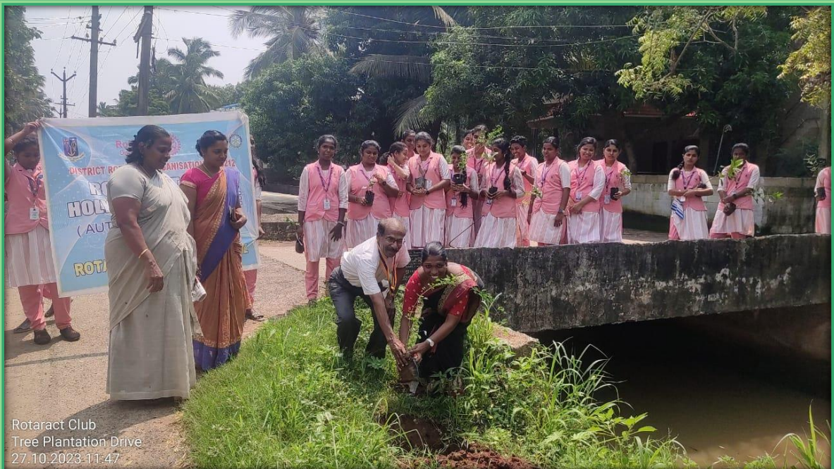
Rotaract Club Tree Plantation Drive 27.10.2023 11:47