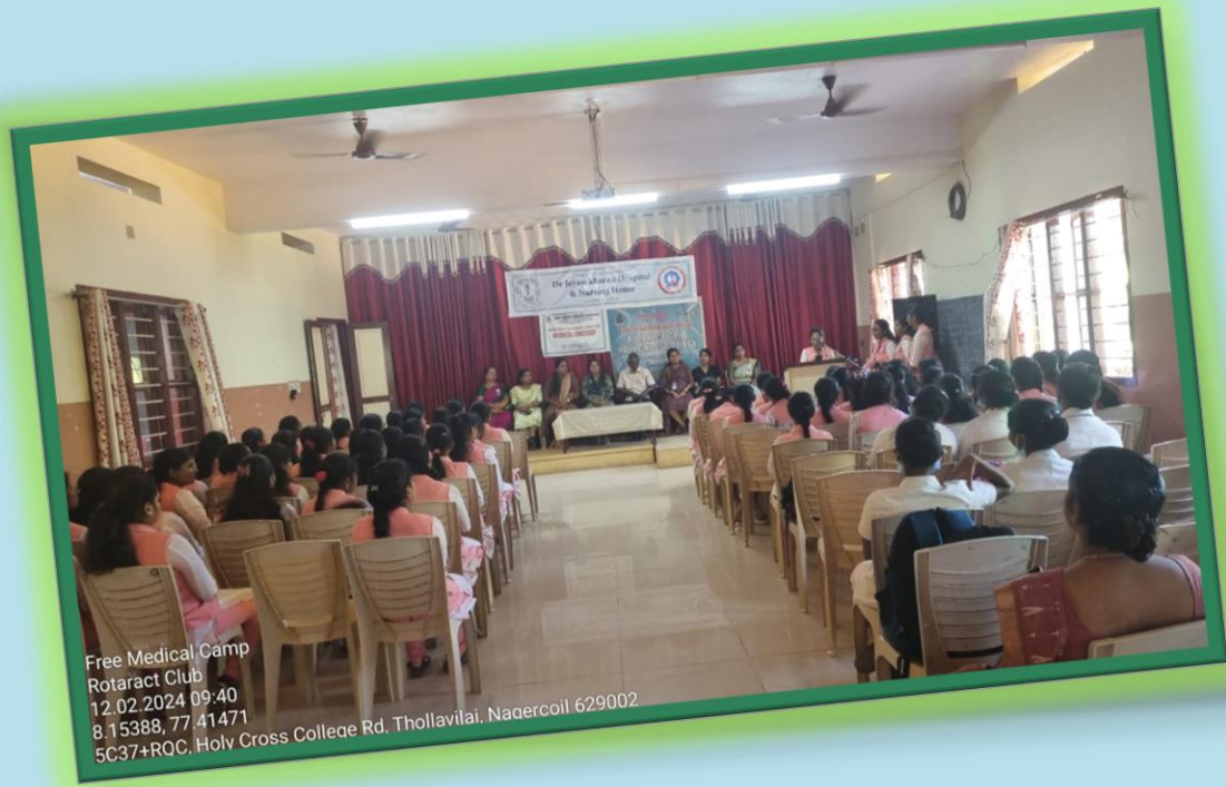
Free Medical Camp Rotaract Club 12.02.2024 09:40 8.15388, 77.41471 5C37+RQC, Holy Cross College Rd, Thollavilai, Nagercoil 629002