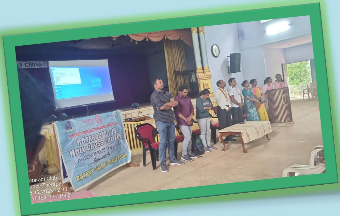
Rotaract Club Dance Therapy 5.12.2023 12:33 15454, 77.41568